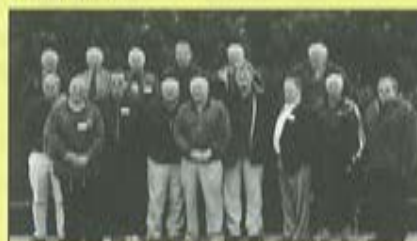
40 years on - 1961 1st XV

The 1st XV team of 1961 kindly donated a new scoreboard for the Gully field.