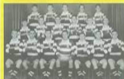
1962 1st XV