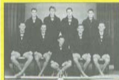
1962 Rowing Eight