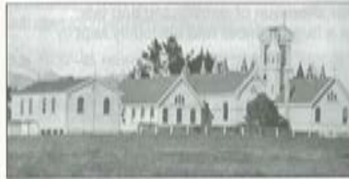
The First School. Built 1881 and destroyed by fire 1916

The initial steps towards the establishment of a secondary school in Taranaki were taken in the year 1887 by the Hon. T Kelly, member of the House of Representatives for New Plymouth. The New Plymouth High Schools Act, 1878 allowed the endowment of land to the value of 10,000 pounds and a grant of 1,730 pounds towards a building fund.